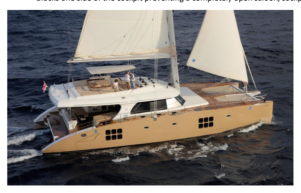
Flybridge steering on a Sunreef 70' Loft