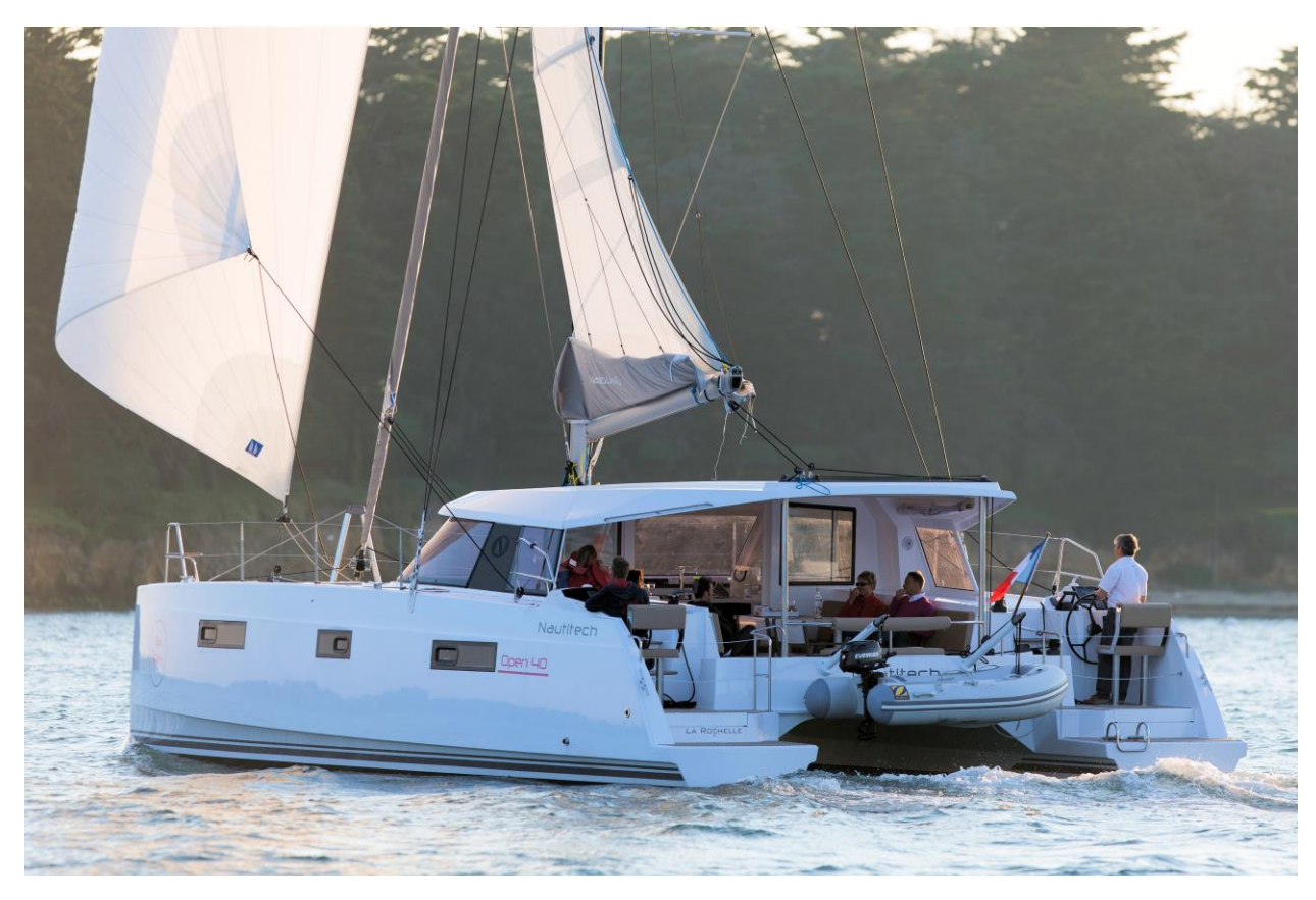
Bavaria - Nautitech 40 Open – aft steering

The cruising catamaran has come a long way from its Polynesian origins. New building materials, advances in production techniques, findings in aero and hydrodynamics have shaped this once ancient sailing craft into the most popular cruising and live aboard platform. What has remained a constant in the last 50 years however has been the basic layout and accommodation plan. Saloon and cockpit are on the main deck and staterooms and heads below. The galley is the few variables - as especially on cats above 40' it can be found either in the hulls or on the main deck. Rather different are the steering stations which designers either place in the stern, midships, on so called "mezzanine" helm stations, the flybridge or even in front of the coachroof. The vast majority of cruising cats utilize wheels although some builders offer additional tillers helmed via aft seats. Each of these steering positions has their advantages and drawbacks in terms of the activities of keeping watch, sail handling and weather protection. There are some few iterations of these basic steering positions but we will focus on the most popular.