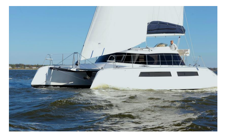
Author's Alpha 42 design – mezzanine steering