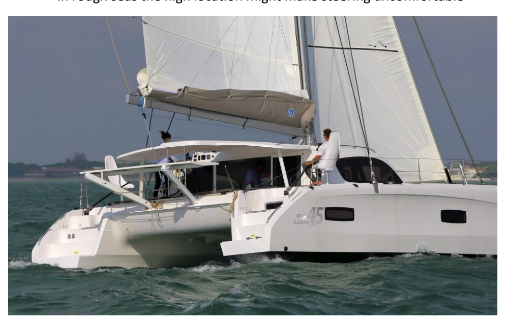
The Outremer 45 – with optional Sportseat steering